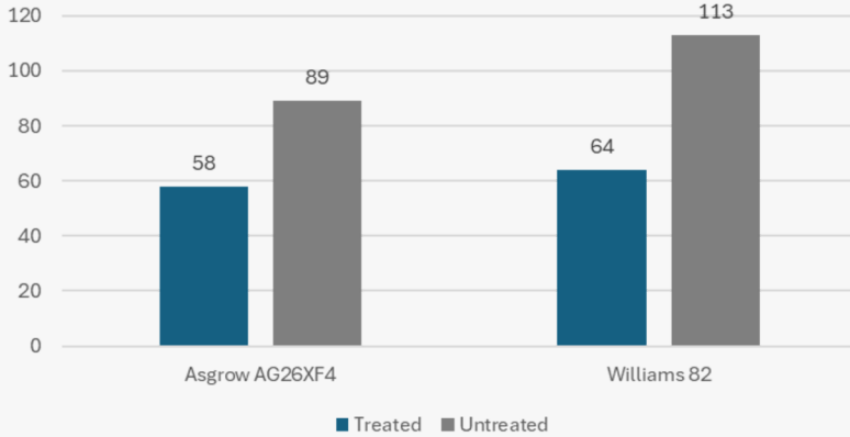
SCN Control (eggs/root)